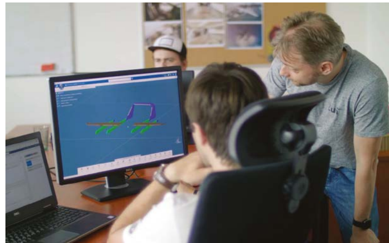
Top Image: Comparison of the scaled-down model against the design Bottom Image: 3D model of the rotors of the VTOL system